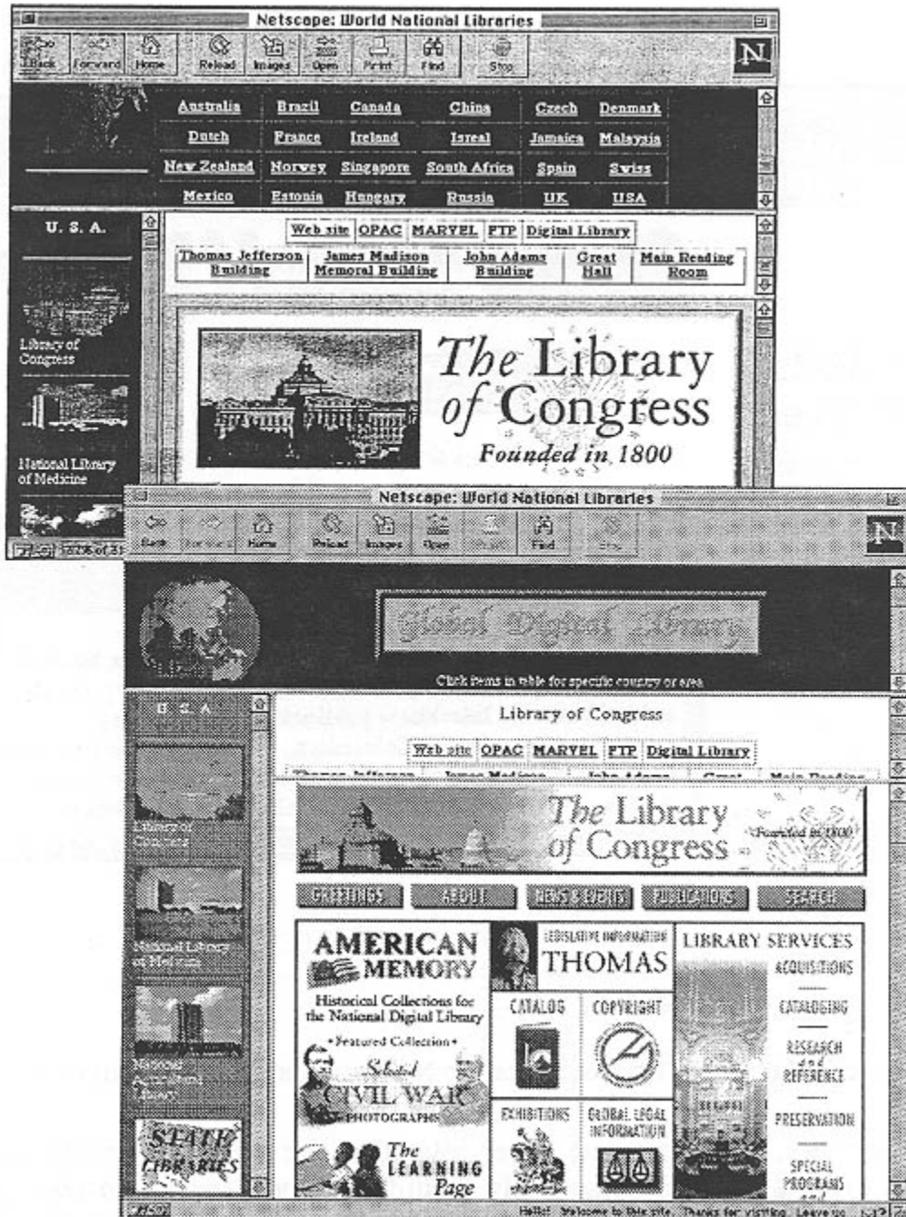
Figure 3. Accessing Library Congress' American Memory via GDL